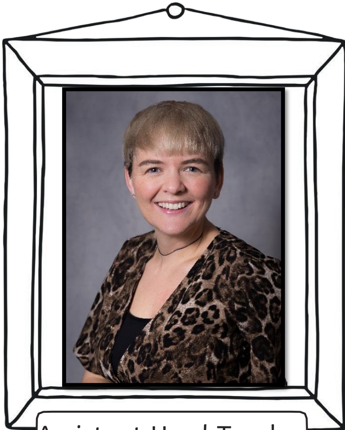
Assistant Head Teacher